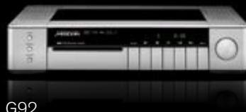
G92 Surround Player, Controller, Tuner

H, W, D: 90, 440, 350mm (3.54, 17.32, 13.78 in)