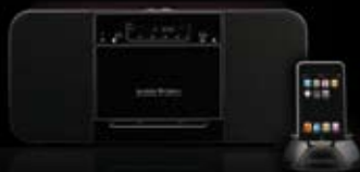
Alfred Dunhill AD88 Compact CD/DVD/Radio system

Developed and engineered for Alfred Dunhill by Meridian Hand built in England using piano-lacquered traditional woods combined with cutting edge electronics and software Plays back CD and DVD, AM/FM/DAB radio and a docking station for your iPod With 2.1 DSP loudspeakers, AD88 distills all of Meridian's most advanced technologies H, W, D: 193, 400, 182.5mm (7.6, 15.75, 7.2in); Weight 8.5kg (19lb)