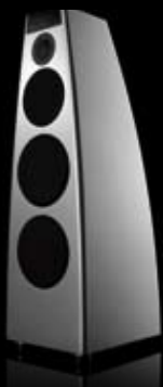
DSP7200 DSP Loudspeaker

High-performance 3-way active DSP loudspeaker Four separate amplifiers – one for each drive unit – for maximum efficiency & sound quality Cabinet constructed from “Meridium” for the purest reproduction of sound On-board upsampling DSP and ‘apodising’ filters can even correct flaws in a recording H, W, D: 1072, 350, 415mm (42.25, 13.75, 16.5in); Weight 55kg (121 lb)