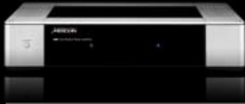
G56 2-Channel Power Amplifier

2 x 100 Watts Balanced and single-ended input connectivity Ultra-low feedback, DC coupled design with fast and articulate bass for superb sound Switchable bridge mode for single channel, high power output H, W, D: 90, 440, 350mm (3.54, 17.32, 13.78in); Weight 13.5 kg (29.7 lbs).