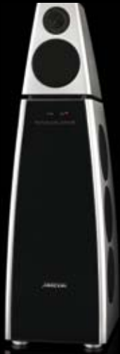
DSP8000 DSP Loudspeaker