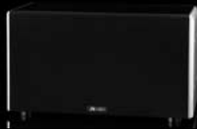
SW5500 Digital/Analogue Subwoofer

Digital and analogue input connectivity for maximum flexibility Configurable for use with Meridian or other systems Ideal partner for DSP5500 or DSP7200 Loudspeakers 2 x 12-inch high-efficiency long-throw drivers H, W, D: 417.5, 775, 411mm (16.5, 30.5, 16.25in); Weight: 50kg (110lb).