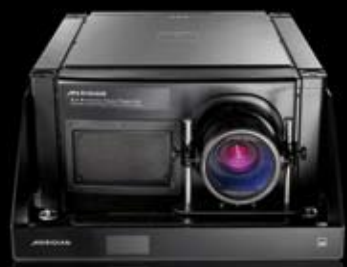
810 Reference Video System

10 megapixel – highest video resolution available from a home theatre system Dedicated video scaler converts all digital sources to full 10 megapixel resolution Each projector is individually calibrated to ensure optimum performance in every installation Integrated anamorphic lens solution controlled seamlessly according to source aspect ratio Projector: H, W, D: 317, 675, 977mm (12.5, 26.6, 38.5 in); Weight 62kg (136.4lb) not including feet. Scaler: H, W, D: 82, 435, 250mm (3.25, 17.25, 9.75 in) (2U rack mounting); Weight 5kg (11lb)