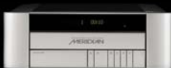
800 Version 4 Reference Optical Disc Player

Multi-format player for CDs, MP3 CDs and DVD-Video Powerful on-board video scaler converts DVD and SD sources to full 1080p HD SmartLink output connection for enhanced performance with Meridian Surround Controllers Card-based construction for maximum performance