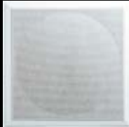
DSP420 DSP In-wall Loudspeaker

Compact 2-way active DSP loudspeaker for in-wall installation Separate amplifiers for high and low frequencies for maximum efficiency & sound quality On-board DSP includes dynamic bass extension for best sound performance from an in-wall loudspeaker H, W, D: 450, 450, 102mm (17.72, 17.72, 4.02in); Weight 8kg (17.6lb)