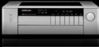
G68 Surround Controller

Controls all sound within a home theatre system Meridian Room Correction manages room resonances SmartLink source connectivity for automatic mode selection Connects direct to Meridian DSP Loudspeakers Maximum analogue and digital connectivity H, W, D: 132, 440, 350mm (5.20, 17.32, 13.78 in); Weight 10kg (22lbs)