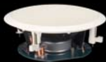
P200Z / P200ZQ In-Ceiling Loudspeakers

Compact in-ceiling loudspeaker available with circular (Z) or square (ZQ) bezel 2-way design with independent bass driver and pivoting tweeter Ideal for distributed audio systems, and in home theatre applications where space is limited Outer frame dimensions 273mm (10.75in); Depth for installation 101.6mm (4in); Weight 2kg (4.5lbs) approx