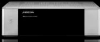
G55 Multi-Channel Power Amplifier

5 x 100 Watts Balanced and single-ended input connectivity Ultra-low feedback, DC coupled design with fast and articulate bass for superb sound Weight 20 kg (44 lbs)