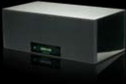
DSP3100HC DSP Centre-channel Loudspeaker