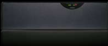
DSP5500HC DSP Centre-channel Loudspeaker

H, W, D: 200, 734, 266mm (7.88, 28.92, 10.47in); Weight: 17kg (38lb)