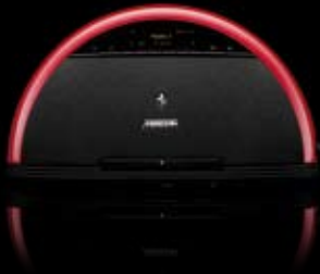
F80 Compact CD/DVD/Radio system

Transportable audio system combining incredible audio performance with supreme versatility CD/DVD player, AM/FM/DAB radio and alarm functions Combine the F80 and i80 with universal dock for iPod to realise the full potential of your digital music library Available in a variety of Ferrari colours H, W, D: 230, 408, 185mm (9, 16, 7 1 / 4 in); Weight 6.5kg (14.3lb)