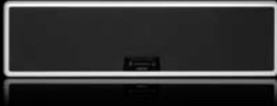
DSP7200HC DSP Centre-channel Loudspeaker

High-performance 3-way active DSP centre channel loudspeaker Four separate amplifiers – one for each drive unit – for maximum efficiency & sound quality Cabinet constructed from “Meridium” for the purest reproduction of sound Perfect complement for Meridian DSP7200 and DSP8000 Loudspeakers H, W, D: 295, 1060.5, 478.25mm (11.6, 41.75, 18.8in); Weight 64kg (141 lb)