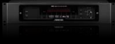
G57 2-Channel Power Amplifier

2 x 200 Watts Balanced and single-ended input connectivity Ultra-low feedback, DC coupled design with fast and articulate bass for superb sound Weight 20 kg (44 lbs)