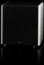
SW1600 Digital/Analogue Subwoofer

Digital and analogue input connectivity for maximum flexibility Configurable for use with Meridian or other systems Ideal partner for DSP3100 or DSP5200 Loudspeakers 12-inch high-efficiency long-throw driver H, W, D: 417.5, 417, 411mm (16.5, 16.4, 16.25in); Weight 28kg (62lb)