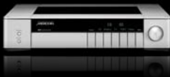
G01 Stereo Control Unit with Tuner

Seven source pre-amplifier with dual differential volume control Built-in radio tuner (AM/FM or DAB/FM) Optional integrated phono stage Weight 8.5 kg (18.7 lbs)